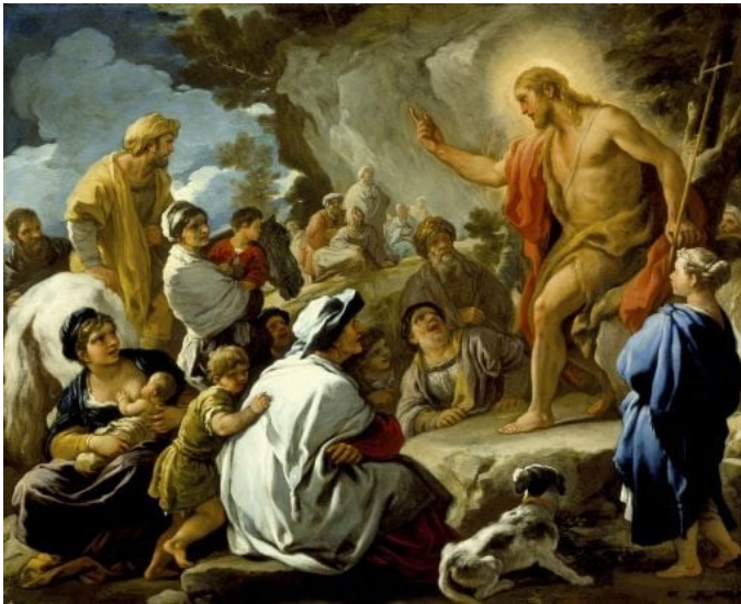
St. John the Baptist Preaching Luca Giordano